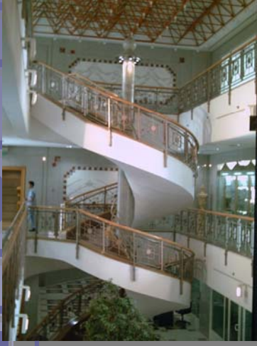
Interior Design (Al-Usaimi Complex)