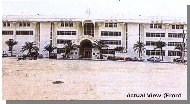
Actual View (Front